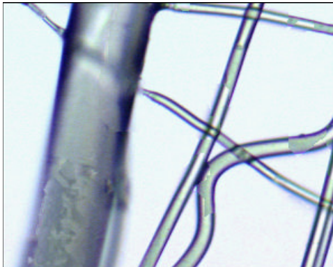
Figure 1: Part of the original image (0.63 microns/pixel).

Demonstrate that the Clemex Vision image analysis system can distinguish the fibers and measure their diameter.